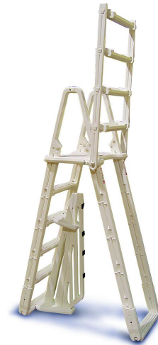
FIGURE 1: EXAMPLES OF LADDERS THAT CAN BE SECURED WHEN THE POOL IS NOT IN USE

In addition, the pool cannot occupy more than 15% of the area on the lot it is located on.