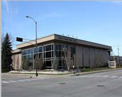
These parcels face the award winning Elisha D. Smith Public Library Building in Menasha