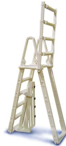
FIGURE 1: EXAMPLES OF LADDERS THAT CAN BE SECURED WHEN THE POOL IS NOT IN USE

In addition, the pool cannot occupy more than 15% of the area on the lot it is located on.